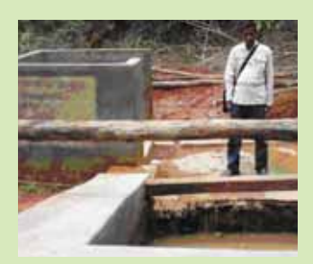
Bathing enclosure for Women

During the preparation of EPA matrix in Baliguda, priority identified was to provide bathing enclosures for women in some of the VSSs. In both the first and second batch sites, six VSSs have constructed bathing