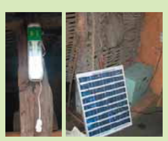
Solar Home Lighting Systems in the Rangaparu VSS of Belghar FMU

Rangaparu VSS of Belghar FMU is one of the most interior villages, inhabited by the Kutia Kandhas. There was no electricity in the village. Two Tata Solar home