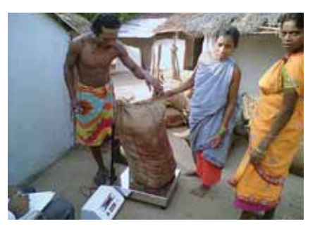
.....but by weight Credit goes to Dongri VSS, Koraput FMU supported by OFSDP