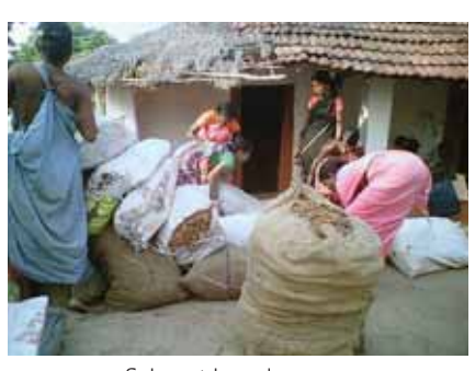
Sale not by volume.....