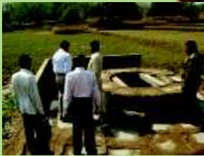
Platform of village well under E.P.A- PAKANAGAON VSS