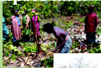
Ekgharia VSS Angul Division