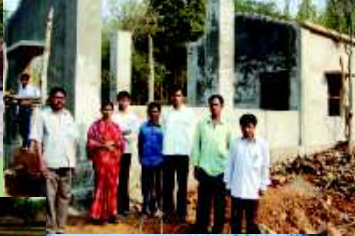
Phulbani - Kaladi VSS