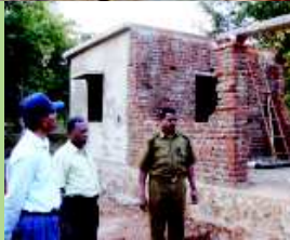
Phulbani - Khaumunda VSS