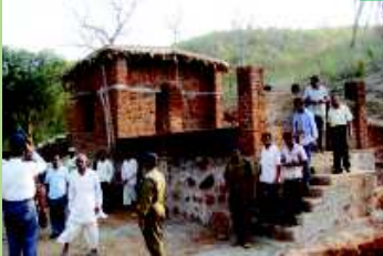
Phulbani - Pakangaon VSS