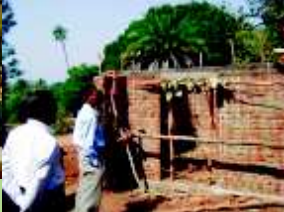
VSS Office-Cum- Meeting Hall at PAKANAGAON Under Construction