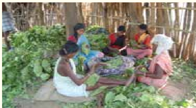
Goat Rearing and various other Income Generation activities promoted through Koilipari VSS