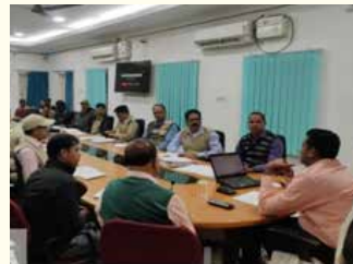
DMU Level Review Meeting held at DMU Conference Hall of Keonjhar DMU