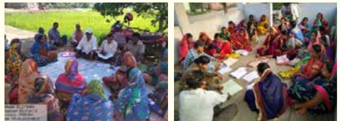
SHG rating Exercise at Akul Pradhansahi under Telkoi FMU of Keonjhar and Ambapal village under Angul DMU

In a nutshell, out of the total number of 8619 SHGs brought under rating and gradation, it was found that 2731 numbers are high performing SHGs with Grade-A, 3459 are medium with Grade-B and 2181 numbers (grade-C and D) need improvement over their existing practices. Similarly, the report for the study on Assessment of Refilling Potential and Impact of Supply of LPG Connection under OFSDS, conducted PMC came out during this quarter.