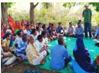
Participation of VSSs in Palli Sabha- Angul and Chhatabeda VSS of Nawrangpur DMU