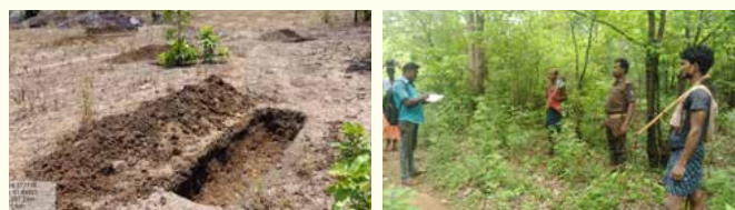
Staggered Trench under SMC works in Mathili FMU under Malkangiri DMU Survey demarcation of Katada Dangadharsahi VSS under Angul DMU

demarcation of the assigned area have been complete in 3114 VSSs with total demarcated area of 169748.76 ha. Similarly, ANR without gap in 1,60,731 ha area and pillar posting in 3114 VSSs has been completed by December, 2019. Some of them are presented here in a snapshot.