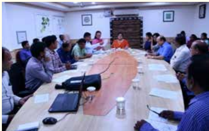
Pledge of Integrity and probity during Vigilance Awareness Meeting at PMU on 28.10.2019