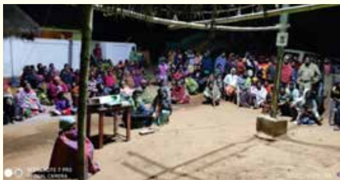
Awareness Campaign on Forest Fire Prevention by Angul DMU and Smokeless Chullah awareness campaign at Sanaolma VSS of Nawarangpur DMU