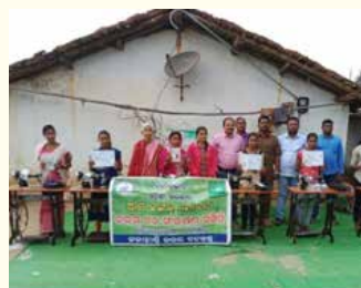
Sewing Machine support to the members of Kalam VSS under Kalahandi (N) DMU