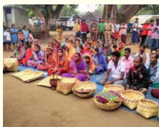
Livelihood support to the Bamboo Craftsmen of Brahmapur, Nandapur and Pokatunga VSSs under Angul DMU (1)

The AJY team has accomplished many activities pertaining to forest protection and livelihood improvement of the local communities. Some major initiatives taken during the last quarter are presented in brief through photographs.