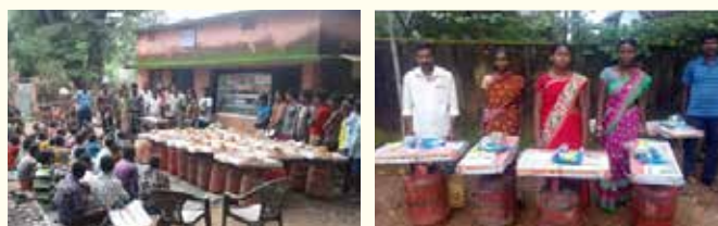
Ujjwala LPG Distribution at Dahimalia VSS, Keonjhar WL DMU and Kholbilung VSS, Bamra (WL) DMU