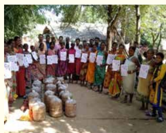
Livelihood Improvement Training and Demonstration on Mushroom Cultivation at Badpur VSS under Nawrangpur DMU