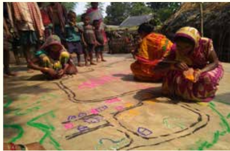
Social mapping for preparation of Microplan in Pabala VSS under Angul DMU and Daudabhata VSS under Malkangiri DMU

Micro Plan is a community based empowering process for preparation of road map for development and management of forest and to address the livelihood opportunities of the forest dependent communities. Micro Plan has been perceived to be a guiding document for the communities and the facilitators in implementing the planned intervention for forest management & livelihood enhancement. AJY has mandated to cover all 7,000 VSSs with independent microplan within 6 years of project intervention. As on 31st December, 2019 preparation of micro plans in 2830 VSSs have been completed. Micro planning processes in 540 VSSs, which have been covered during the current financial year, are under progress.