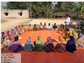
SHG Meeting of Bankapatuli VSS of Ghatgaon FMU under Keonjhar DMU

Apart from this, a two-day residential training to the DEOs (Accts.) on Basic Accounting Procedure and Maintenance of Primary Books of Accounts under the project Ama Jangala Yojana was organized at OFSDS Conference Hall, Bhubaneswar during 16-17th October, 2019. Twenty four participants, especially DEO (Accts.) and AJY coordinators across 23 AJY DMUs participated in the training.