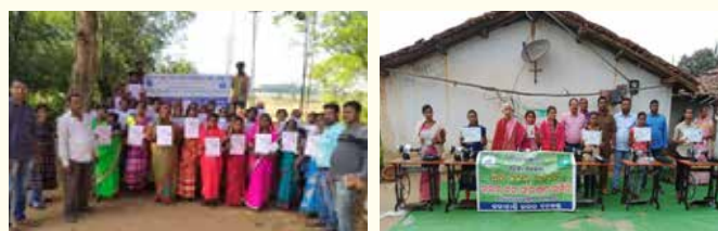
Course Completion Certificate and Support material distribution to Poultry Farmers under Dumadei VSS, Nawrangpur DMU