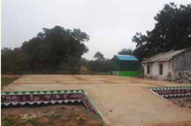
Construction of Drying Yard in Charamula and Rabnaguda VSS under Nawrangpur DMU

Due to the sincere effort of the AJY teams, several entry point activities have been accomplished from MGNREGS and