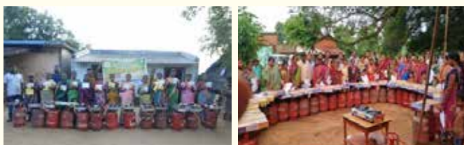
Ujjwala Gas Distribution to Kerokuda VSS Kalahandi (N) DMU and Bargarh DMU

Petroleum and Natural Gas, Government of India. OFSDS is playing a pivotal role, as a facilitator, in implementation of this scheme. One of the mandates of the project is to assist in energy conservation so as to reduce the dependency of local communities on forest for their energy needs.