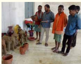
Livelihoods improvement through clay craft at Tondaguda VSS, Nawrangpur DMU