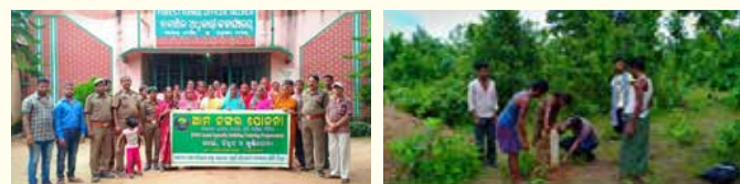
Survey, Demarcation and Pillar posting in Talcher FMU under Angul Forest Division