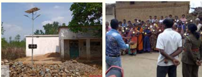
Convergence for Solar Light Equipments under Bargarh DMU