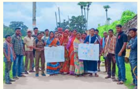
Microplan preparation under progress in Saratpara VSS under Nawrangpur DMU and Angul DMU