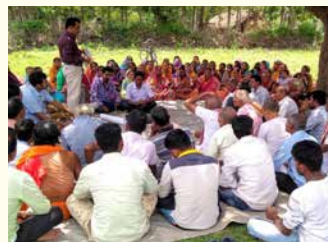
Capacity building training at Jereng Dehurisahi VSS under Angul DMU