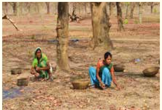
Livelihood Activities by Koilipari VSS of Malkangiri DMU