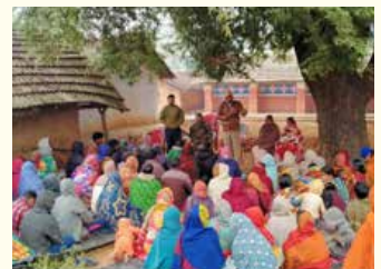
G.B Meeting for VSS Formation at Kodiposa, Keonjhar FMU