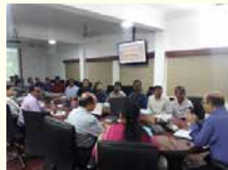
Training to the DEOs (Accts.) on Basic Accounting Procedure organized on 16-17th October, 2019