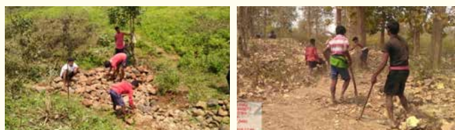
LBCD in Bondiki VSS under Malkangiri DMU Fire line tracing in Mudulipada VSS under Malkangiri DMU