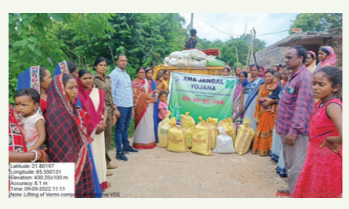
The Process of Vermi-compost production and sale by Aharposi VSS members