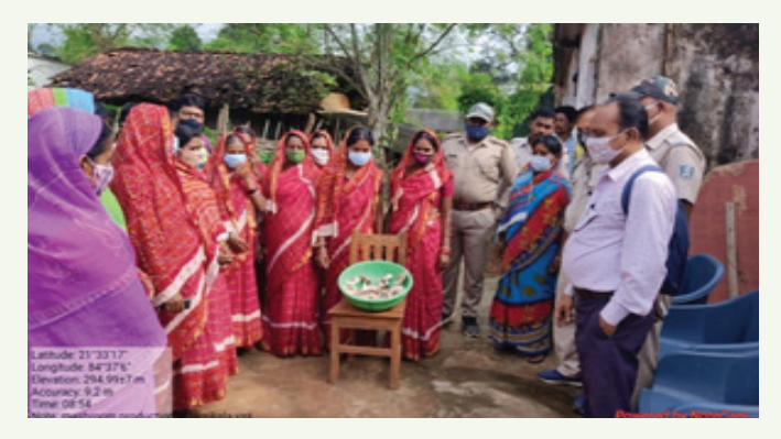
Mushroom production & sale by SHG members

During 2007-08, they started group farming of pisciculture in a leased pond through loan support from Utkal Gramya Bank, Deogarh. They were unable to manage the group activity in a profitable way for which they incurred substantial loss and closed the activity for a considerable period. Till the beginning of the year 2020, they were not doing any income generation activity in group mode, anticipating repetition of the previous experience. Afterwards, in the year of 2020, the VSS encouraged them to take up alternative income generation activities to boost their income and to utilize their valuable time in a productive way. They invited the