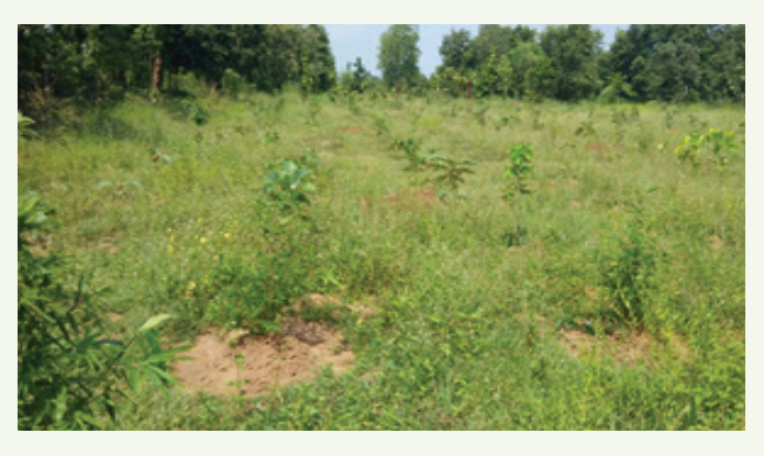
Mango plantation through NHM