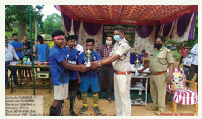
DFO, Bonai and Range Officer, Sole felicitating the Sports Club members during the Range level Hockey tournament.