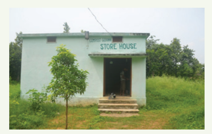
The stock of vermi-compost & the storehouse

periodical visit to the village could find an alternative way for possible solution to this problem. Having being provided with the scope of contingent funds for VSS, Bolangir Forest Division in a Pilot Project Mission, has organized a meeting with Bijakhaman VSS for encouraging them to take up a business opportunity.