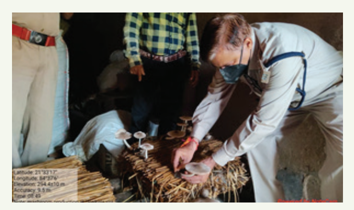
SHG Members demonstrating the method of mushroom cultivation