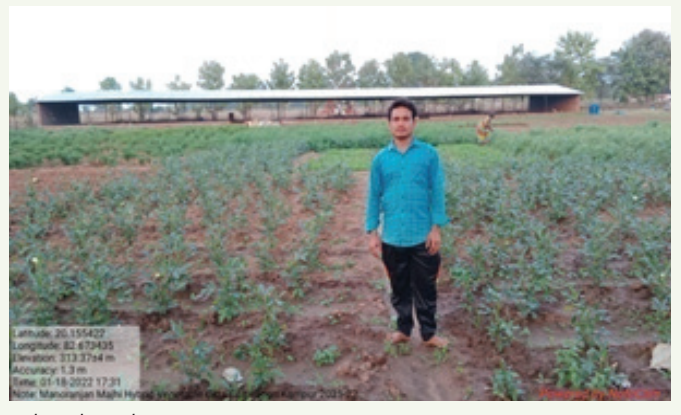
Vegetable cultivation by the VSS members through convergence