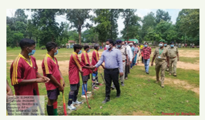
Sports Clubs are being mobilized for Protection of Forest Resources through Primary Response Groups